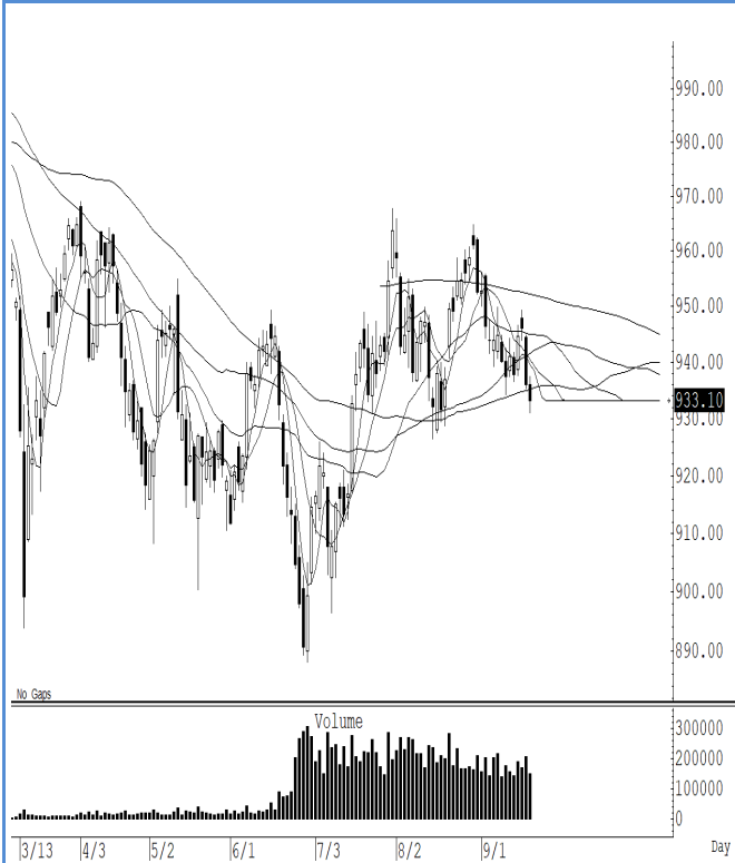
S50U23 (Close 933.10 Chg -2.90)